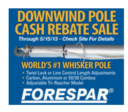
April Issue 2013